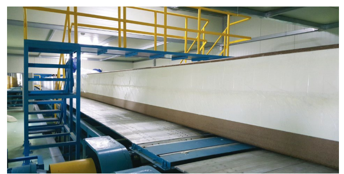
Continuous Foaming Line