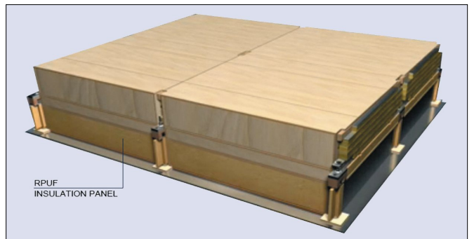
NO96 L03 Insulation Panel