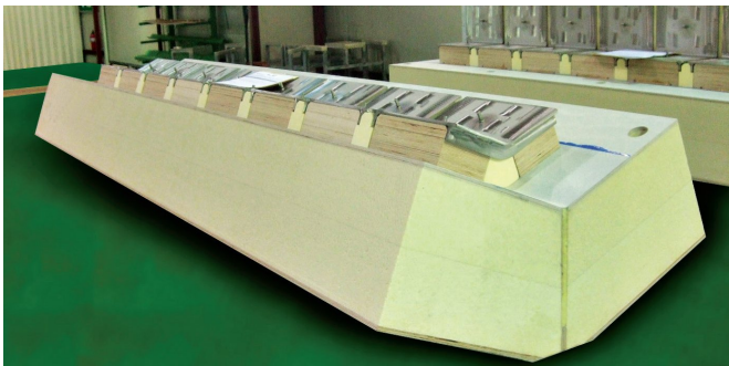
Mark III Flex 135° Corner Panel